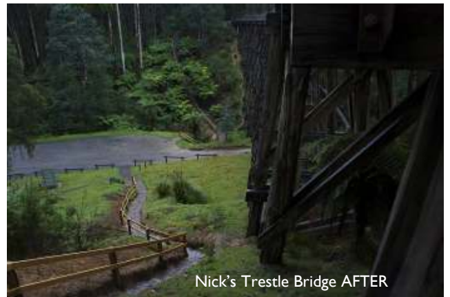
Nick's Trestle Bridge AFTER