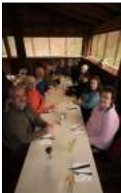
The Gang at The Tool Shed in Noojee. Be warned—the meals here are ENORMOUS!

RINGWOOD INTERCLUB COMP Entries are due for submission to the Committee at the July meeting for judging / selection.